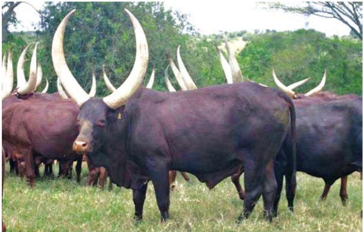
Ruhogo” (deep brown coloured bull) – with some of the special qualities considered for selection