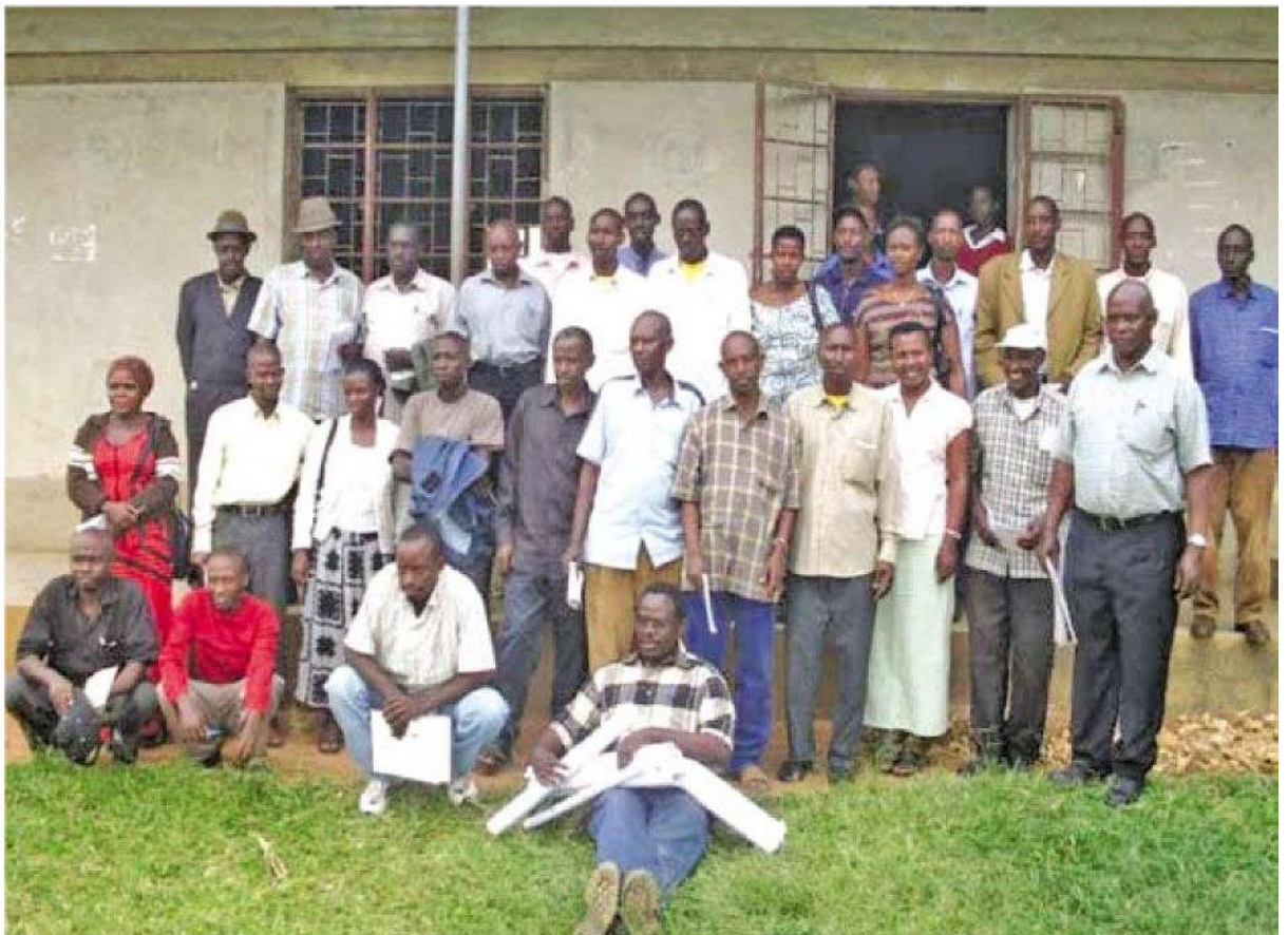
Participants during the herders' meeting held on 5/3/09 in Sanga, Nyabushozi, Kiruhura District