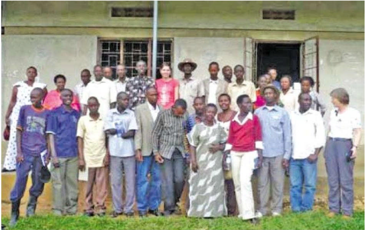
Participants during the herders' meeting held on 4/3/09 in Sanga, Nyabushozi, Kiruhura District