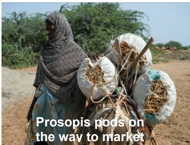
Prosopis pods on the way to market