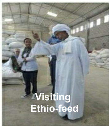
how Prosopis is incorporated into a nutritious feed

PENHA's philosophy is to seek to understand and develop pastoralism as a real and important economic activity in the parts of the world which are arid. These visits were an important part of this process.