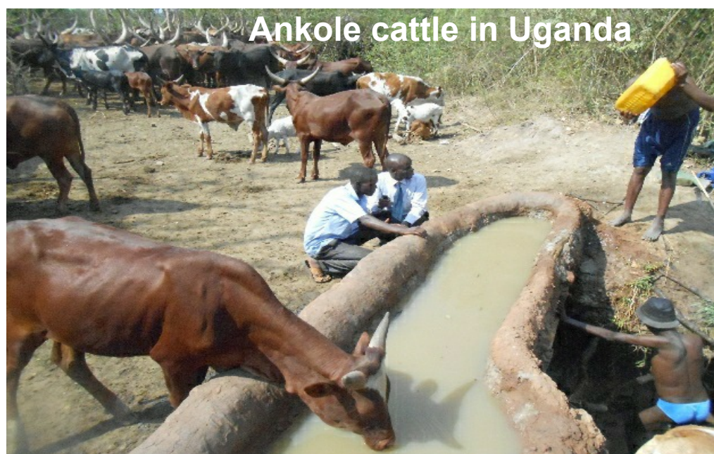
Ankole cattle in Uganda

indigenous livestock breeds. She also took part, along with a PENHA representative from Somaliland, in two meetings of the African Union in Kampala on how to make operational the AU's policy framework on pastoralism. She also wrote articles and gave radio interviews on the importance of biodiversity in livestock development.