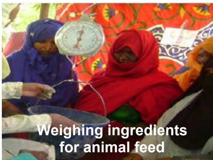
Weighing ingredients for animal feed

village and to the boosting of the confidence of local women. Engaging with women and increasing the inclusiveness of the project was achieved through PEAKS relationship with the men and their family members. PEAKS persuaded men of the importance of women's active engagement in the local development process.