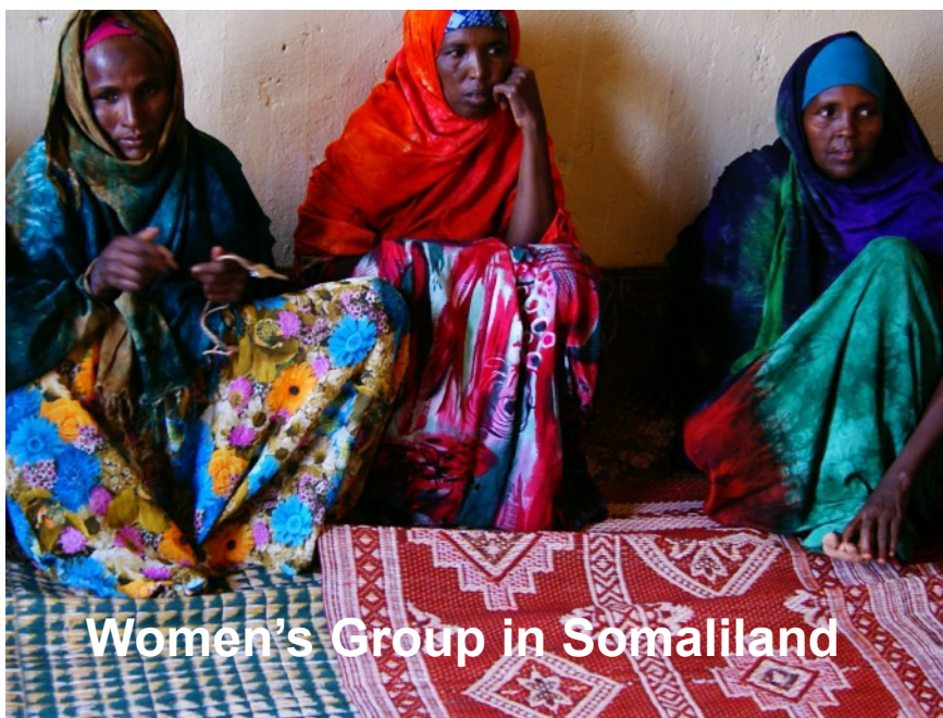
Women's Group in Somaliland

PENHA has provided training and equipment