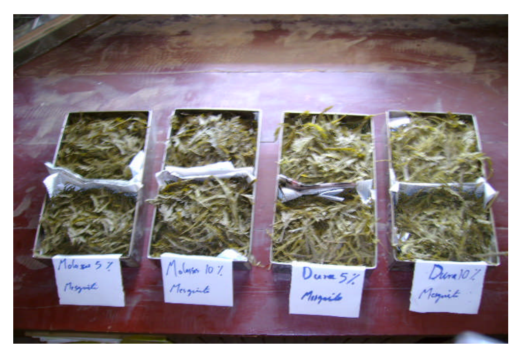
Mesquite leaves as silage combined with other ingredients.

Mesquite leaves silage was prepared by picking up leaves manually from mesquite trees around Animal Production Research Centre. The picked leaves were collected in plastic bags, weighed and then spread on plastic sheets at lots of 100 kg of fresh leaves each time. The crushed sorghum grains were spread over leaves at the rate of 5 % on fresh basis. Then mixed thoroughly and filled back into the plastic bags, tied and kept in an underground pit (2*3*1.5 m). The silage was left for one month at least before opening for animal feeding.