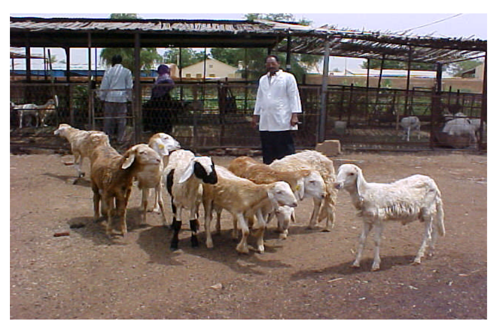
Experimental sheep and Dr.Talal Mirghani research coordinator from APRC side standing in the middle row.

Eight adult non castrated sheep and eight milking goats of local type (33 \pm 5.7 \text{ and } 25 \pm 6.5 \text{ kg} \text{ respectively}) born and reared at Animal Production Research Centre (APRC) in Sudan were used in those experiments. Animals were dosed with prophilactive dose of antibiotic followed by Ivomec injection for ecto and endo parasites control. They were also individually housed with free access to clean water and mineral blocks. The experiment was lasted for 7 weeks with the first week was considered as an adaptation period.