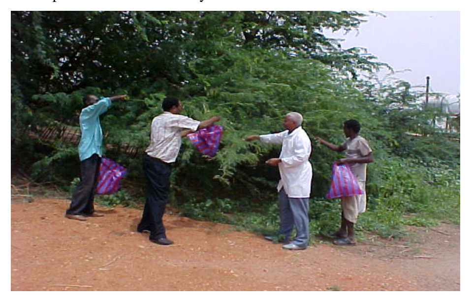
Collection of Prosopis Juliflora leaves at the APRC Centre at Hilat Kuku, Sudan.

Mesquite (Prosopis juliflora) leaves were collected manually from trees around Animal Production research Centre, Kuku, Khartoum North during autumn (June-July 2007) by labourers. Then the freshly collected leaves were used for silage making after mixing with additions of ground sorghum grains (feterita) and molasses at the rate of 5% and 10% respectively. Three replicates of each mixture were prepared. After that the mixtures were mixed manually and filled into double layered of plastic bags. Then after expelling air, tied tightly and put into plastic barrels. The plastic barrels were then sealed and kept in the dark for one month. The three silage barrels were opened on successive days.